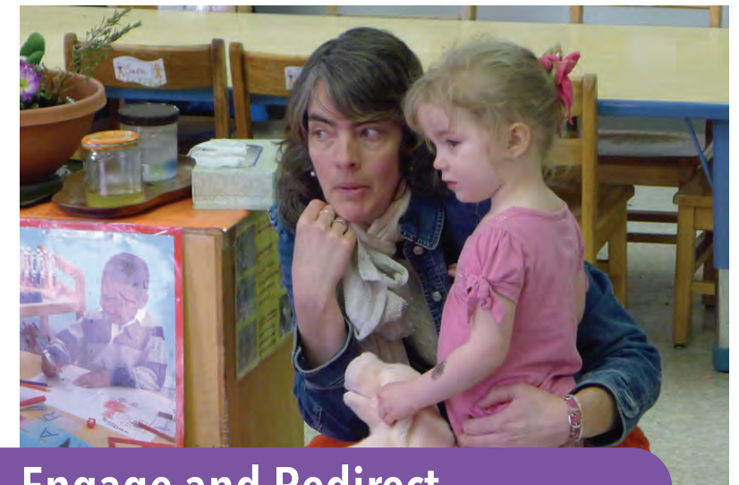
Engage and Redirect

Everyone has a responsibility to keep children safe!