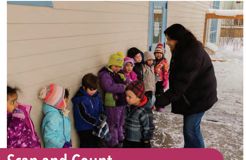
Scan and Count