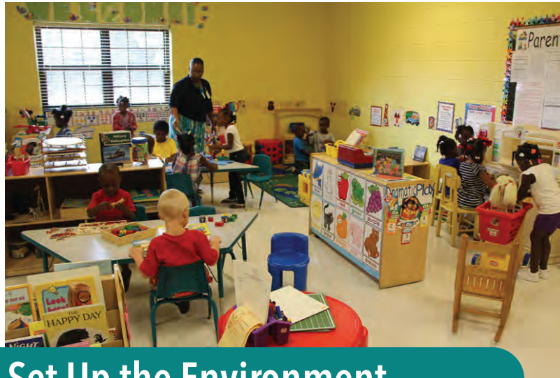
Set Up the Environment